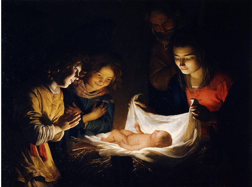
Adoration of the Child' by Gerard van Honthorst